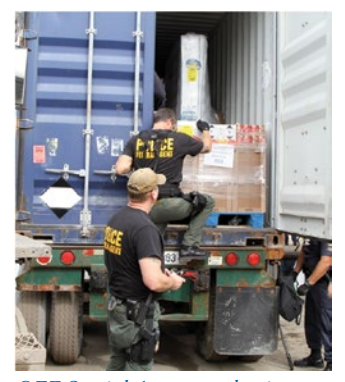
OEE Special Agents conducting an inspection

Asset forfeitures target the financial motivation underlying many illicit export activities. The forfeiture of assets obtained in the conduct of unlawful activity may be imposed in connection with a criminal conviction for export violations, in addition to other penalties. Asset forfeitures prevent export violators from benefiting from the fruits of their crimes, and with no statutory maximum, the value of forfeited assets can greatly exceed criminal fines or civil penalties.