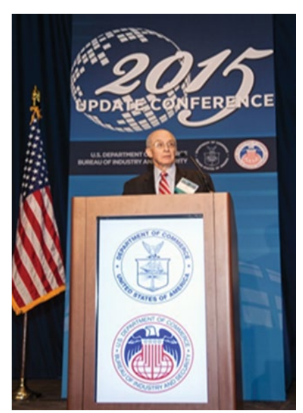
Under Secretary for Industry and Security Eric L. Hirschhorn at the Update Conference in Washington, DC, November 2015.

The Export Enforcement arm of BIS protects and promotes U.S. national security, foreign policy and economic interests by educating parties to export transactions on how to improve export compliance practices and identify suspicious inquiries, supporting the licensing