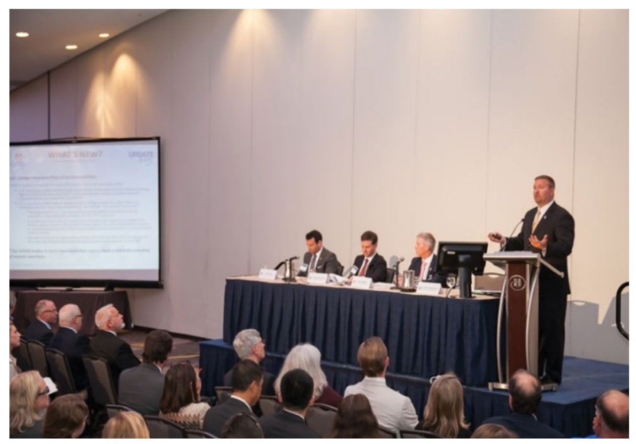
Law Enforcement Panel presentation at 2015 Update

under a particular license number when in fact that license was for a different item. False statements that are made to the U.S. Government indirectly through another person, such as a freight forwarder, constitute violations of the EAR.