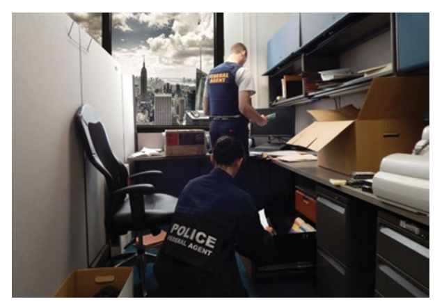
OEE Special Agents executing a search warrant.

The Office of Export Enforcement (OEE) maintains Special Agents at offices across the United States, including its headquarters in Washington, DC, eight field offices located in Boston, Chicago, Dallas, Los Angeles, Miami, New York, Northern Virginia and San Jose, and resident offices in Houston and Portland. In addition, OEE Special Agents have been deployed to Federal Bureau of Investigation (FBI) field offices in Atlanta, Cincinnati, Minneapolis, Phoenix, San Diego and Salt Lake City, as well as to the Defense Criminal Investigative Service (DCIS) office in San Antonio, Texas, to provide enhanced coverage for investigating export violations.