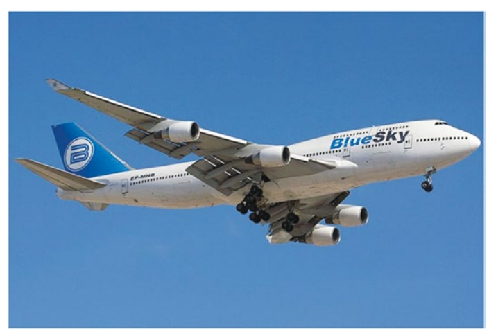
One of the aircraft exported to Iran by the Balli Group, et al.

The Violation: Beginning in at least October 2007, through July 2008, United Kingdombased Balli Aviation Ltd. conspired to export three Boeing 747 aircraft, classified under ECCN 9A991, from the U.S. to Iran without first having obtained the required export license from BIS or authorization from the Treasury Department's Office of Foreign Assets Control (OFAC), in violation of the EAR and the Iranian Transactions Regulations. Specifically, Balli Aviation Ltd., through its subsidiaries, the Blue Sky Companies, purchased U.S.-origin aircraft with financing obtained from an Iranian airline and caused these aircraft to be exported to Iran without obtaining the required